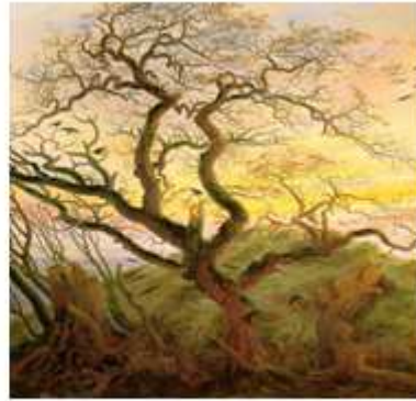
Use of brushstroke