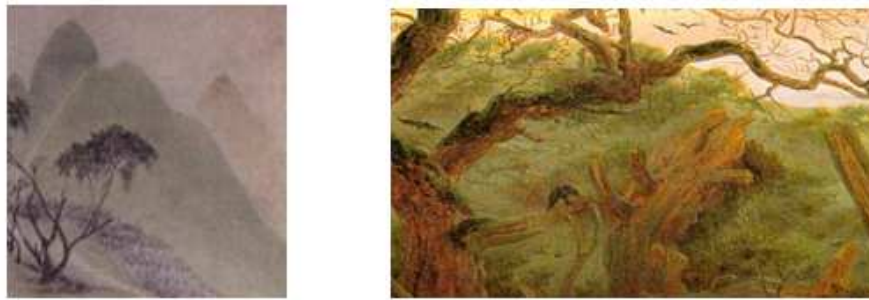
Figure 9: Blow up of the Paintings

All those characteristics can be found in Wu Li's paintings and also the sharp edge of the mountain, the grading tone, transitions from light to dark, shading in Friedrich's landscape painting.