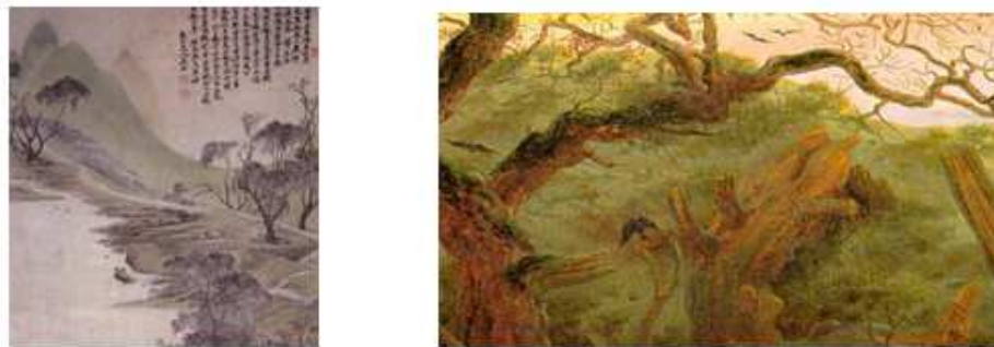
Figure 10: Blow up of the Paintings

In both painting the use of sharp edge for mountain and for tree can be seen.