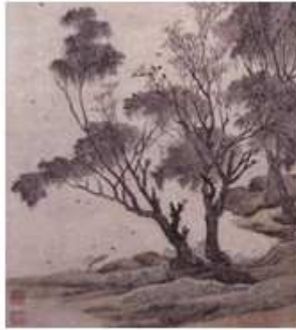
Use of dots